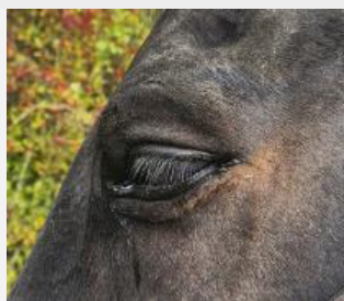
A painful eye with uveitis

Uveitis occurs when there is inflammation to the inner structures of the eye. Uveitis is incredibly painful condition which often results in the horse holding their eye closed with clear discharge present. The eye itself is usually cloudy and the pupil can be very constricted, limiting the horse's vision through the eye.