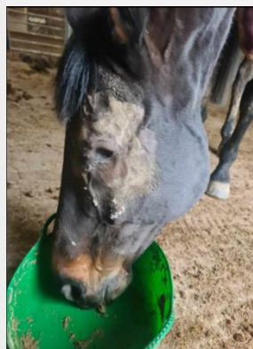
Just a few weeks after an enucleation, the wound has healed, and the horse is adapting well.

In some cases, the damage to the eye becomes irreparable and the best course of action is to remove the eye (enucleation). This operation can be done under sedation and local anaesthetic, either on the yard or in our stocks at North Tawton.