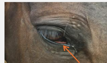
Arrow pointing to an area of mild conjunctivitis.

Conjunctivitis (often known as pink eye in people), occurs when either the inner membrane of the eyelid, or the membrane covering the white of the eye is inflamed. The eye is often sore and often has a clear or green discharge.